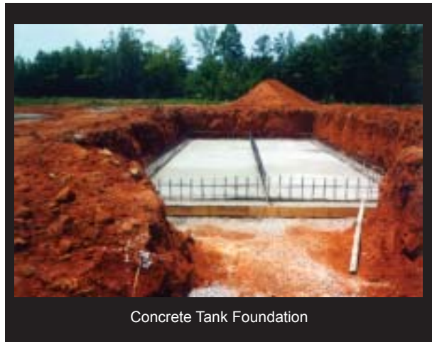
Concrete Tank Foundation

The site has no sewer access and limited land availability for land application of treated wastewater onsite. In addition, the tenant profile is heavy to food service establishments that produce very high strength waste requiring special treatment. A groundwater discharge permit through Georgia Environmental Protection Division (EPD) requires tight standards for limiting Nitrogen discharged to groundwater.